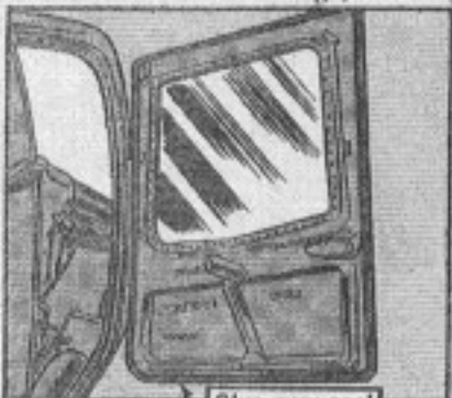
Glue new seal to the door

The usual solution is to remove the damaged seals and install new ones. This time, tho, glue the seals to the cargo and crew doors and not to the door frames on the fuselage, like so: