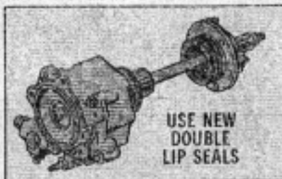
Fig 48, item 76 in TM 55-1520-228-23P (May 76) shows that 2 of the seals are needed. Eyeball Fig 49, item 66, for the seals on the latest engines.

To solve the problem, in the area of the freewheeling unit, you need the new double lip seal, NSN 5330-00-185-0341, in place of the old single lip seal.