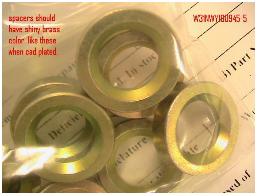
Figure 4: Example Conforming Spacer Sleeve.