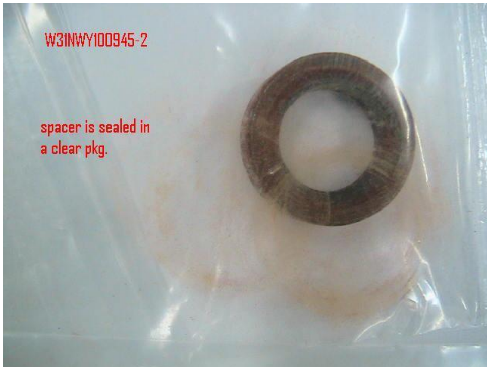
Figure 2: Example Non-Conforming corroded Spacer Sleeve in package.