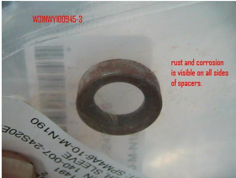
Figure 3: Example Non-Conforming corroded Spacer Sleeve in package.